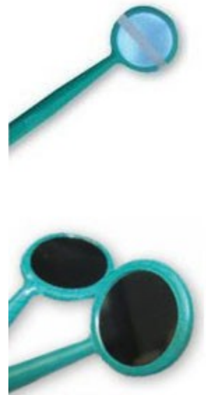
Double Sided Mirror

MASTER CARTON, MASTER SIZE: 63cm × 26cm × 18cm (25"×10"×7")