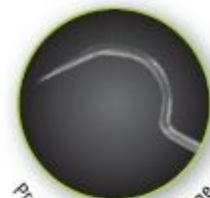
Probe diamond # 23 edge

MASTER SIZE: 49cm × 26cm × 19cm (19.2" × 10" × 7.5")